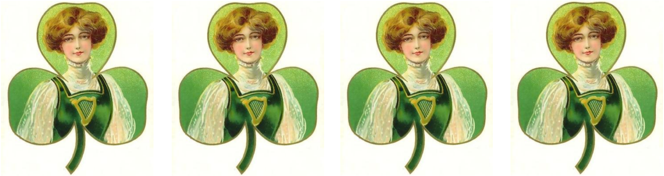
Brooch front (2" diameter)